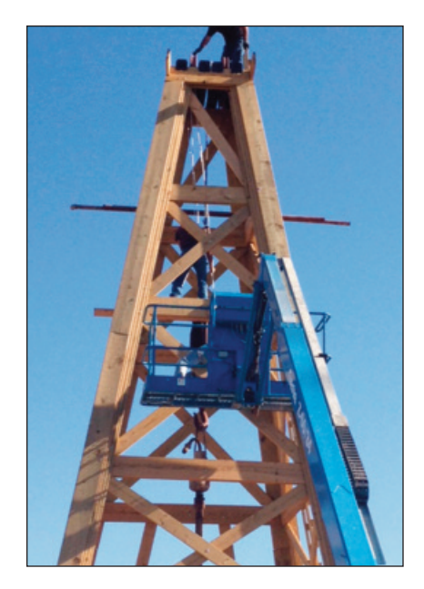
Stringing up the early rotary rig.