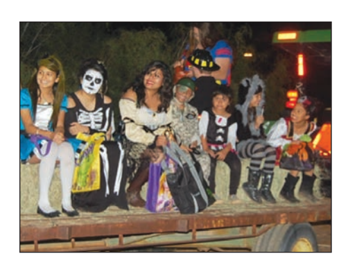
These youngsters enjoy a hay ride outside the Museum, while others inside, at right, watch a pumpkin spew out foam.