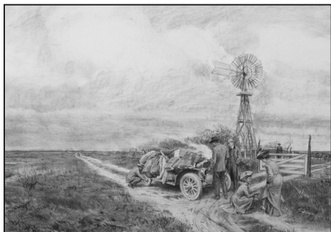
Midland to Carlsbad Mail Run