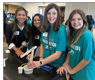
XTO employees lead female students in experiments showing the fun of engineering.