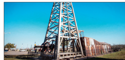
Santa Rita No. 2 with Beam