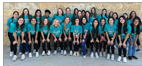
This is one group of MISD middle-school students who enjoyed Engineering Day.